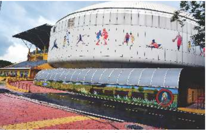
Indoor Sports Complex, Behala, Kolkata