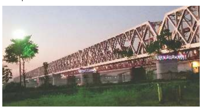
2<sup>nd</sup> Bhairab Bridge on River Meghna, Bangladesh

2. Design, Supply, Installation, Testing, and Commissioning of Computer based Interlocking Colour Light Signalling System on turnkey basis at 11 stations between Ishurdi-Darsana section of Bangladesh for Bangladesh Railway, at a value of Rs.60 crore has been completed in September 2017.