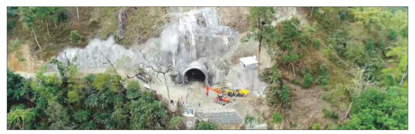
Tunnel work Sivok - Rangpo Project, Silliguri, West Bengal