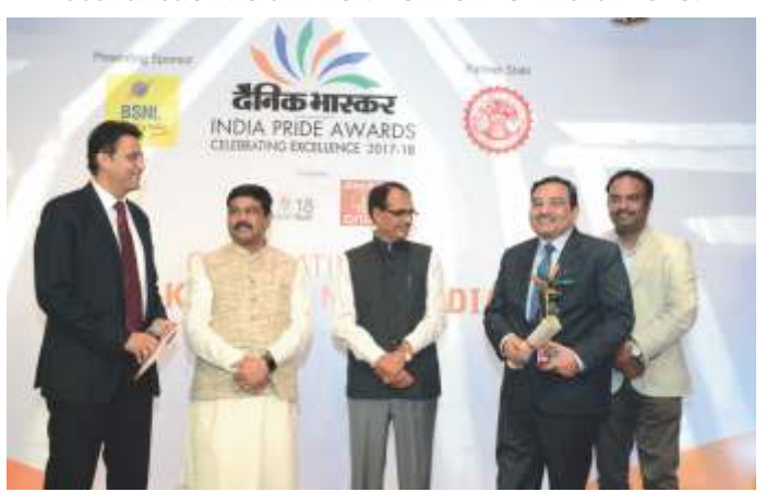
Dainik Bhaskar India Pride Awards 2017-18