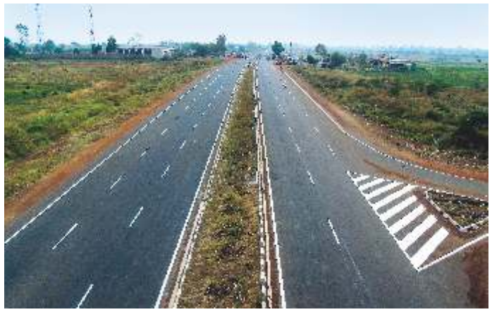
Shivpuri - Guna 4 Lane Highway Project