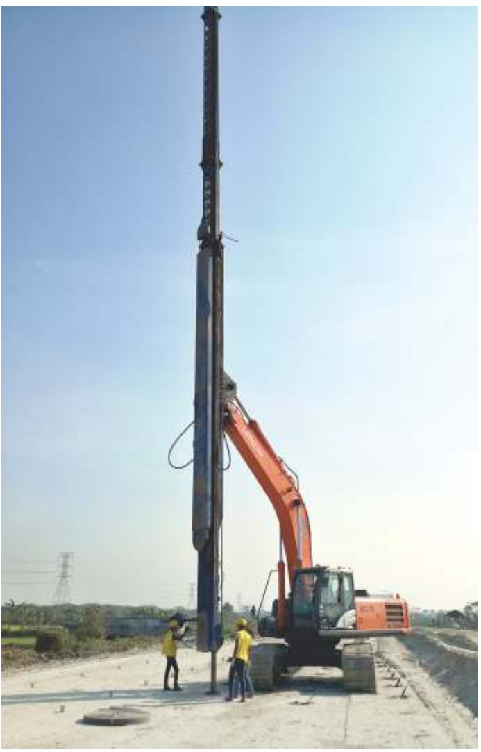
Installation of Prefabricated Vertical Drains, Bangladesh

The project is progressing slowly due to late handing over of encumbrance free land and issuance of drawings for alignment (L-section and X-section), bridges and buildings by the Engineer/Bangladesh Railway.